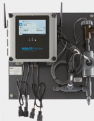
COMPACT C200 (Conductivity + Temperature) + pH