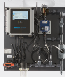
PREMIUM C100 (Conductivity + Temperature + pH + ORP) + TRASAR