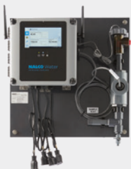
COMPACT C100 Conductivity + Temperature