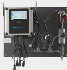
COMPACT C300 (Conductivity + Temperature + pH) + ORP